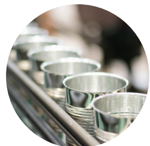
Recyclable non-plastic food packaging