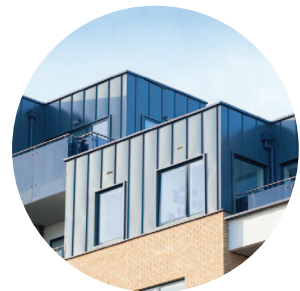
Zero carbon homes