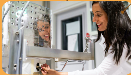
2. Existing workforce development and training