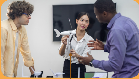
1. Research and development