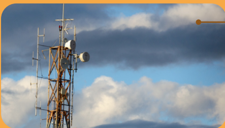
1. 5G and telecommunications infrastructure