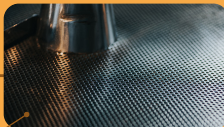
2. Advanced materials (e.g. graphene, carbon fibre)