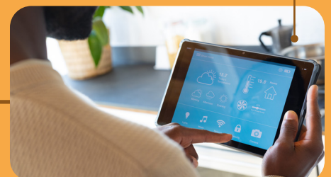
3. Internet of Things devices and systems