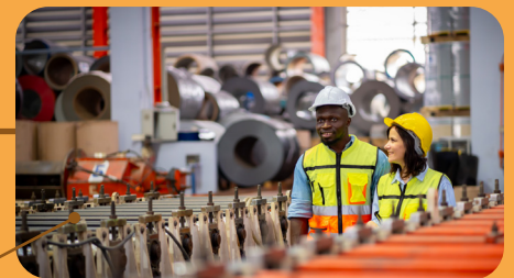
3. Expansion of production capacity